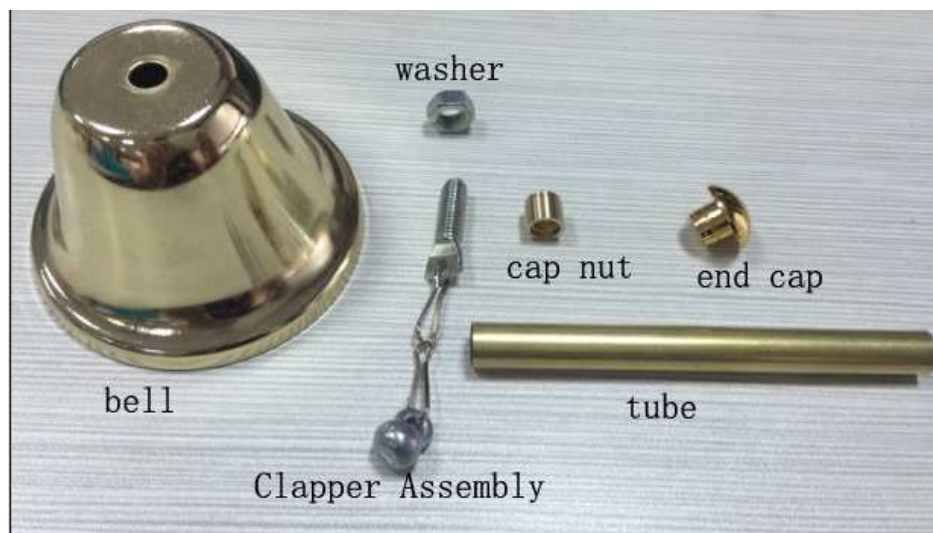
Diagram A Parts list

2 Part Epoxy Glue or Insta-Cure (Cyanoacrylate)